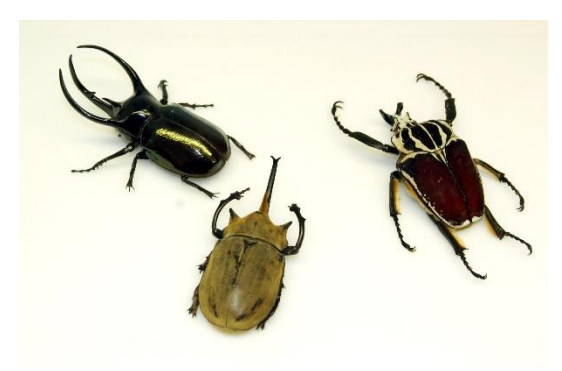
Figure 7: Beetles prepared for Fun Day Friday

The Hampshire's Hidden Treasures case was changed over in September, replacing the Iron Age tankard for minerals that can be found in the shopping trolley. 'Did you know that the weekly shopping trolley contains naturally occurring minerals which are used in a variety of ways? Examples include: Muscovite, which is used in cosmetics to give a sparkly effect when applied to the skin and limestone which when ground up is used in toothpaste to remove plaque.