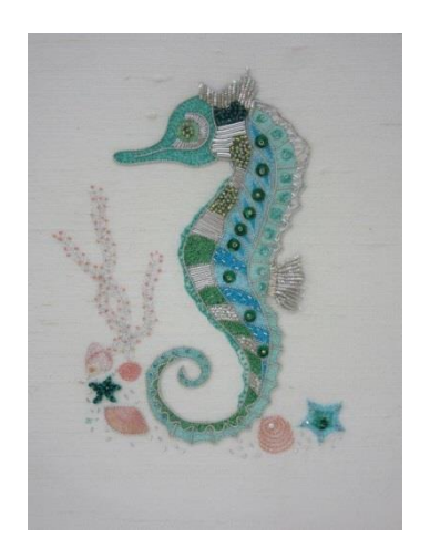
Figure 1: Embroidered seahorse

The second exhibition was by the Solent Art Society and was timed to coincide with Hampshire Open Studios exhibition. A wonderful range of works by local artists was put on display and prompted lots of comments in the visitor's book.