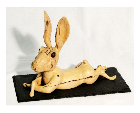
Figure 3: March hare by Fareham Woodcarvers

We will then have Arran Mac and the Fareham Woodcarvers in late Sept and Oct.