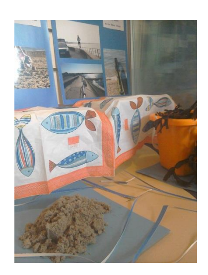
Figure 4: Seaside display

The Pride of Place display cases in the resources room have had some interesting and very different displays in over the last 3 months. At the beginning of July we had a beautiful display of hand-made hats by local milliner Susan Hughes, followed by a fun sea shore display created by one of our volunteers Viv Rance looking at what could be found down on Fareham seashore. In Sept we are hosting the Age Concern photographic display and book tour 'Getting On' which features contributions from a number of Fareham residents.